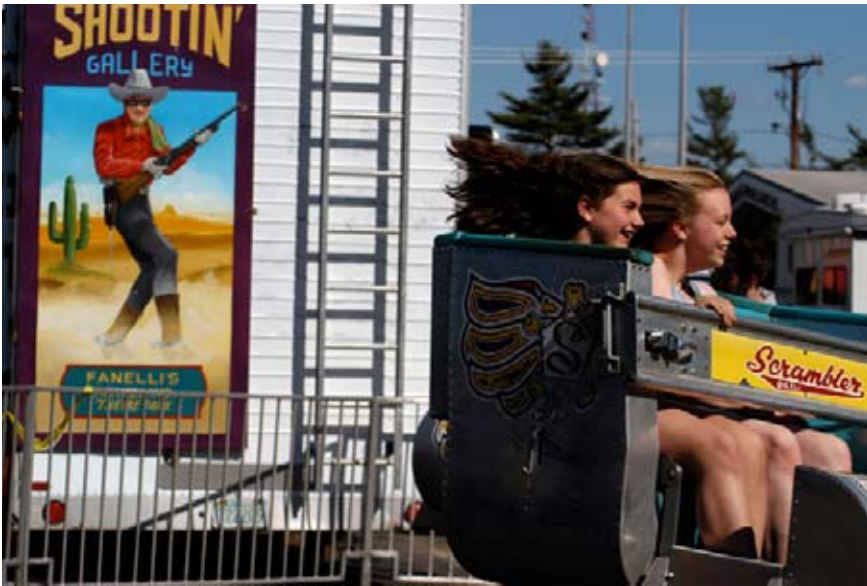
Scrambler Ride