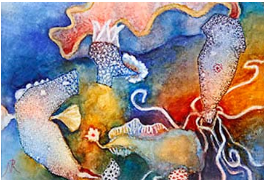
Leeuwenhoek, watercolor by Nan Rumpf

The most captivating part of painting for me is the process. I like to see how watercolors and other watermedia react to different painting surfaces. Does the surface affect the edges...the flow...the puddling properties of the paint? Experimenting with different methods to obtain accidental texture also appeals to me. The results of these experiments give me something to respond to and motivate me to continue experimenting with shape, value, and composition as I develop each painting. I am attempting to capture the essence of forms from my observations, memories, and imaginings.