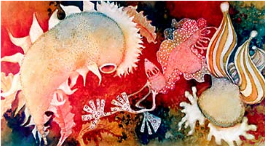
Protocol, watercolor by Nan Rumpf