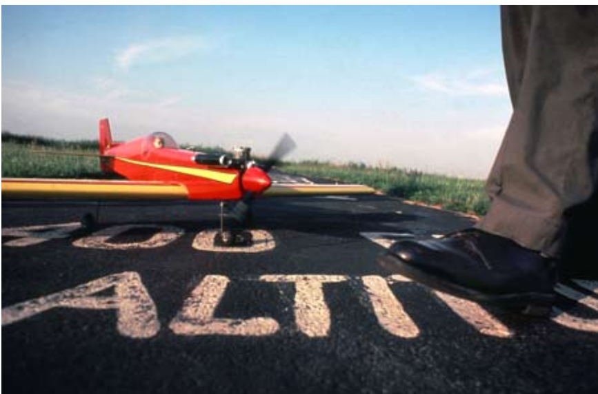
Model Airplane

Her ideas resonate as real time life-style situations that are uplifting and genuinely human.