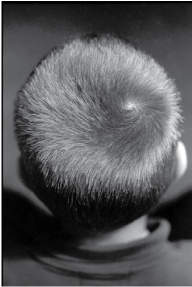
Haircut